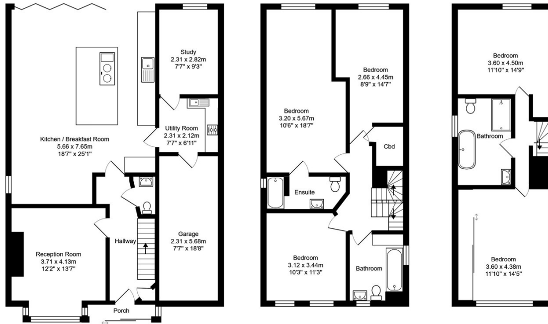
37 Tivoli Road Total Area: 185.8 m 2 ... 1999 ft 2 (excluding garage) All measurements are approximate and for display purposes only.